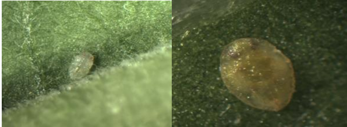
Figure 2 & 3: Greenhouse whitefly pupae (left) and sweetpotato whitefly pupae (right).