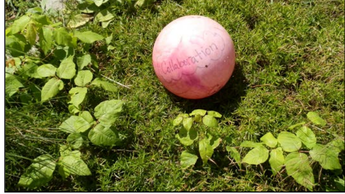
Poison ivy in a location close to student activity.

health director after making the determination that emergency treatment is warranted.