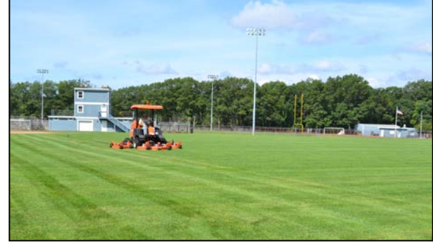
High traffic turfgrass areas require more fertility to recover from wear.