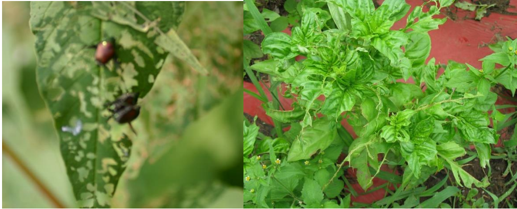
Figures 1 & 2: Feeding damage from Japanese beetles (on right) and feeding damage from Asiatic Garden Beetles (on left).