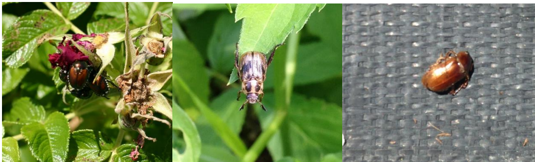
Figures 3 & 4 & 5: Adult Japanese beetle, oriental beetle, and Asiatic Garden Beetle (from left to right).

Larval stages of scarab beetles feed on the roots of grasses and other plants during the fall and spring months. There is one generation a year.