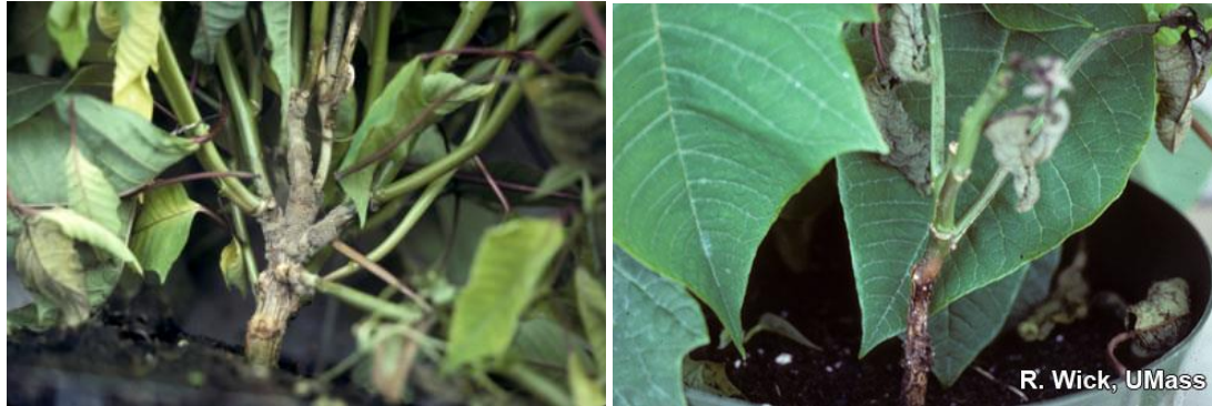
Figure 1 & 2: Botrytis stem canker

Botrytis Leaf, Stem and Bract Infections on Poinsettia can damage poinsettias during production, and most importantly, later when symptoms develop on the tender bracts. Leaves and bracts may be predisposed to infection if they are damaged by injury from pesticides or when branches are damaged as poinsettias are moved.