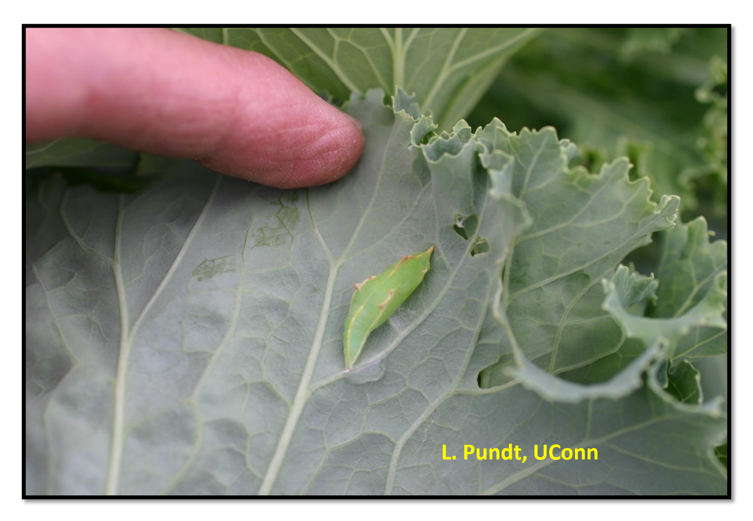
Green chrysalis (pupal stage).