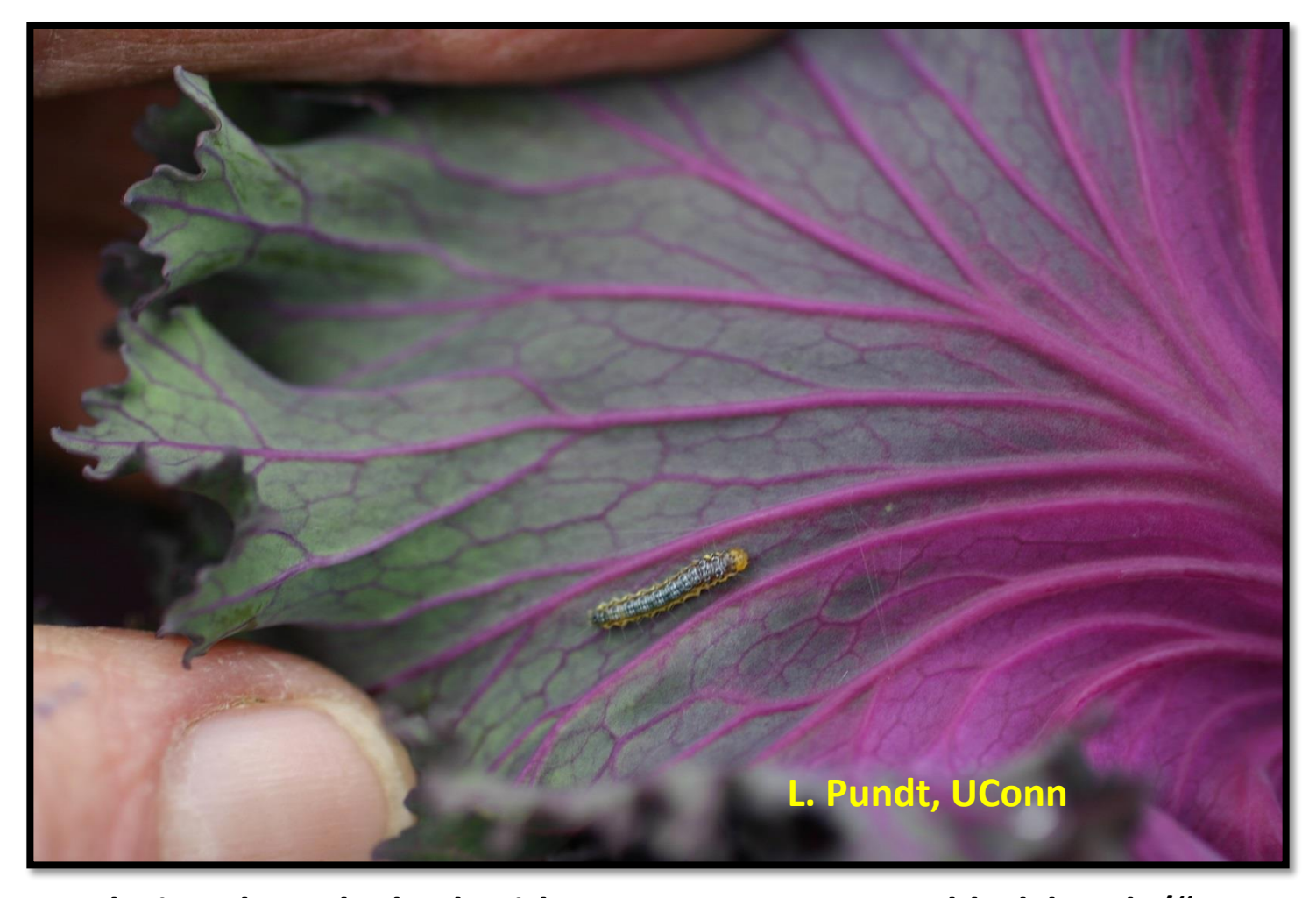
Bluish-gray coloring along the back with numerous transverse black bands ("cross-striped").