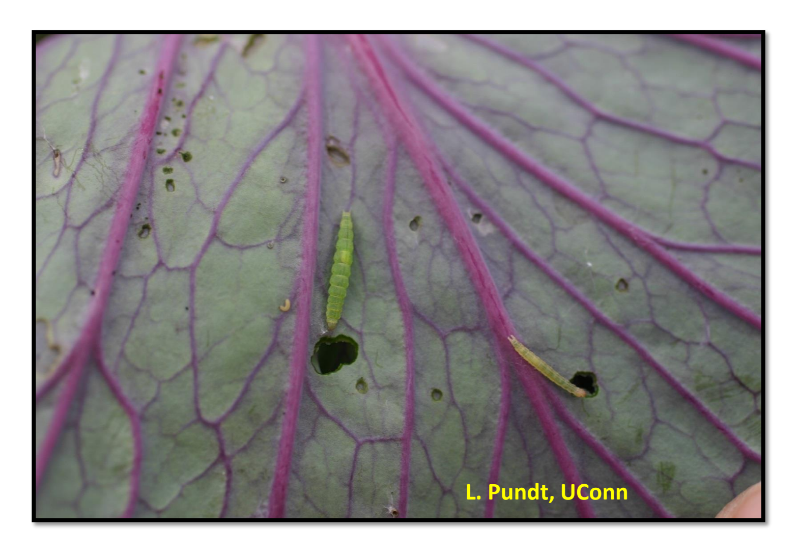
Pale green larvae feed on underside of leaves.