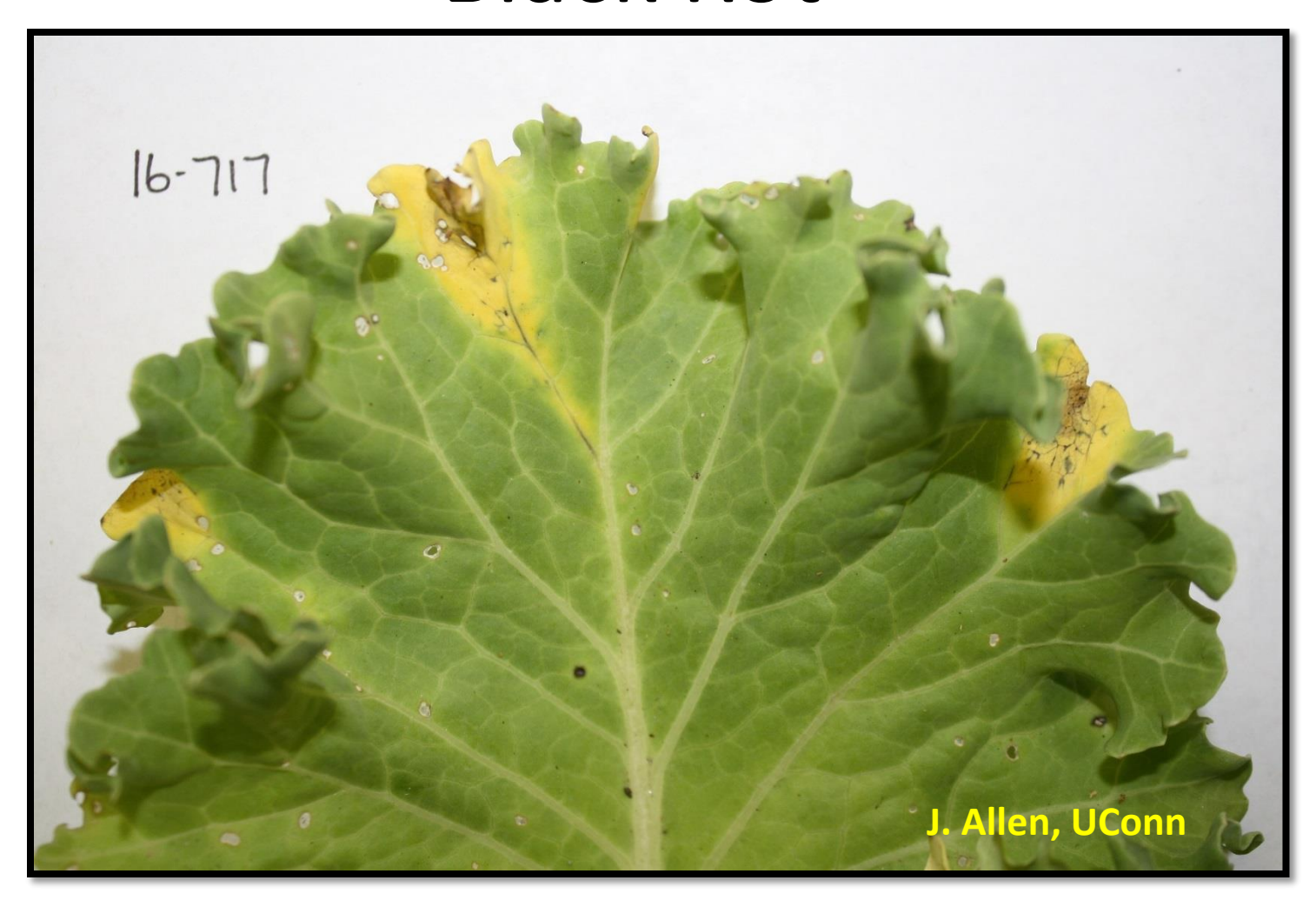
Black leaf veins and v-shaped lesions at leaf margins.