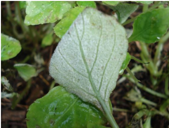
Figure 3. White sporulation on underside of leaf.

During humid or rainy weather, a white coating of spores will be produced on the lower surface of some leaves. Turn over the leaves to look for the white coating of spores; not all leaves will have this. These spores (Figures 3 and 4) are spread by wind, wind-driven rain, and splashing water. Cool night temperatures (58 to 62° F) which encourage heavy dews are ideal for disease development, even if it is hot and dry during the day. New infections occur when leaves stay moist for a few hours. Downy mildew tends to be worse in very dense plantings, where there is overhead irrigation and areas where leaves stay wet for extended periods of time. New infections develop as the short-lived spores are spread by water splash for short distances or by wind currents for longer distances. Another type of spore, a resting or survival spore (called an oospore), is produced within infected plants just before they die. For this reason, it is important to remove infected plants from garden beds as soon as you see them. Oospores are capable of surviving in the soil through the winter and can cause new infections of garden impatiens the following year. There are many different types of downy mildew and they tend to be host specific, so the downy mildew that affects garden impatiens will not spread to coleus, basil or sunflowers.