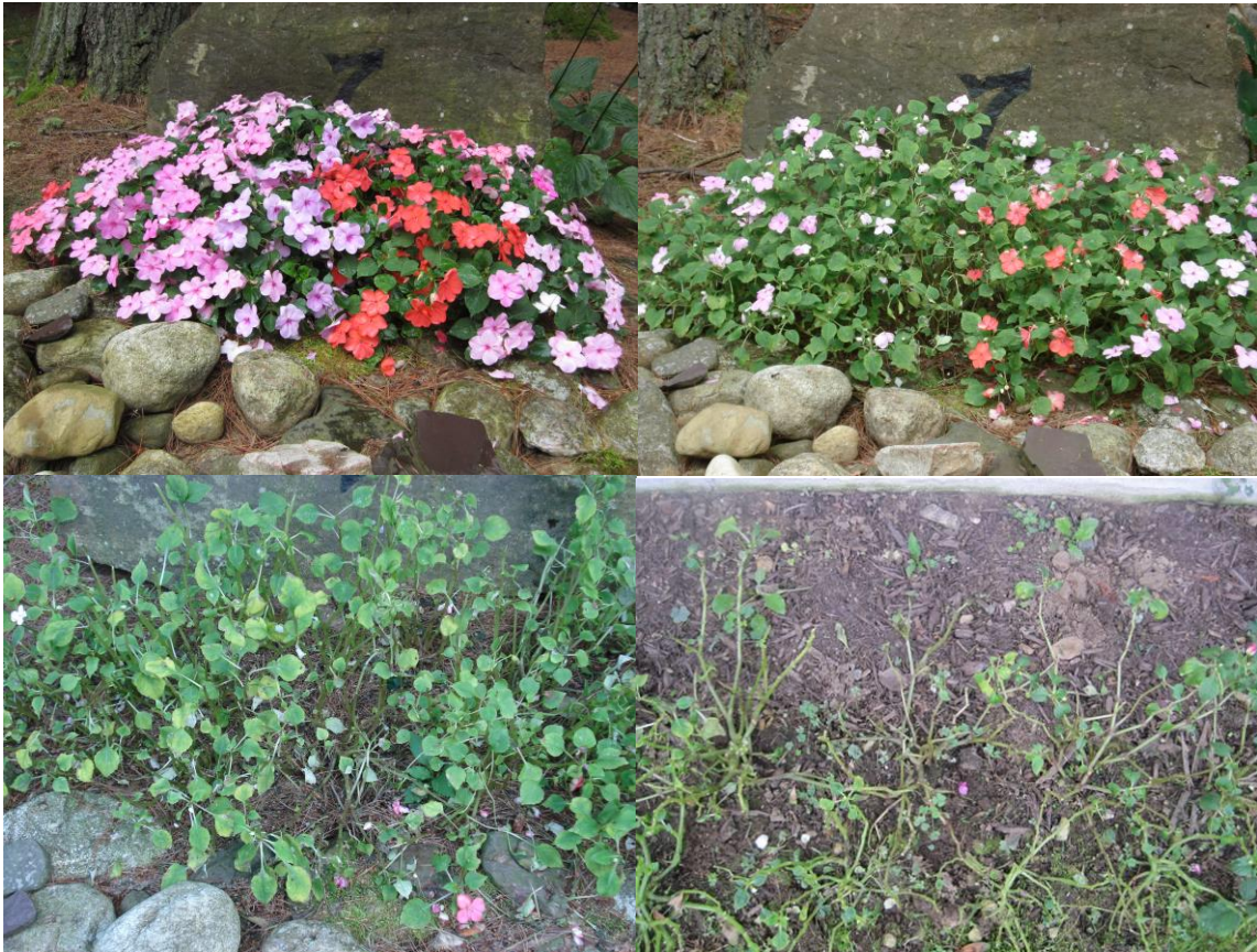
Figure 2. Photos from upper left: healthy impatiens, early yellowing of leaves and reduced flowering, additional yellowing and beginnings of defoliation, heavily defoliated stems.

A progression of symptoms is shown in Figure 2 below.