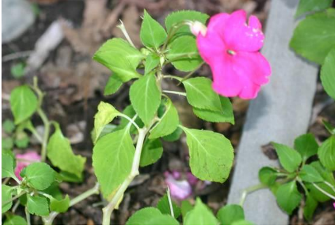
Figure 1. Early symptoms of impatiens downy mildew include yellowing and downward cupping of the leaves.

A progression of symptoms is shown in Figure 2 below.