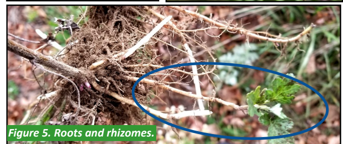
Figure 5. Roots and rhizomes.

Figures 1-3 and 5-6 by Alyssa Siegel-Miles; Figure 4 by Radio Tonreg, North Carolina Extension.