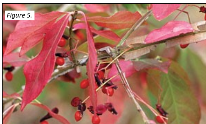
Fruit and fall color.