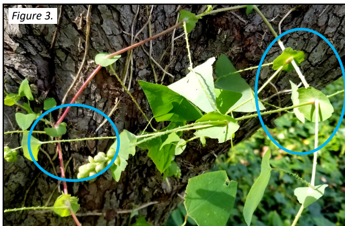
From top left (clockwise): Mile-a-minute climbing habit; arrowhead leaf shape; ocrea and barbs on stems.