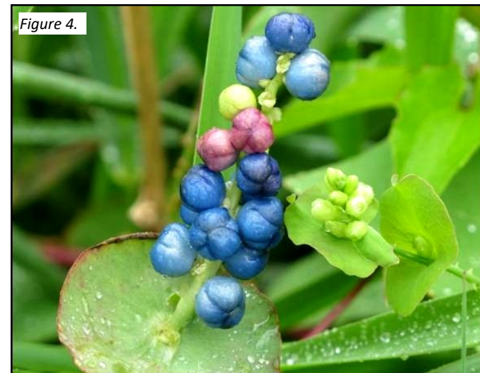
Mile-a-minute fruit, above a saucer-shaped ocrea.