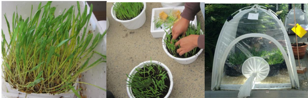
Figure 1: Starter Banker Plant (on left) and planting Sections of the Aphid Banker Plants (in center).and Bug Dorm (on right)