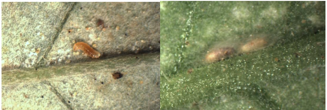
Figures 3 & 4: Predatory midge larvae on left and pupae on right.

When scouting, look for the nearly white pupal cases near the midrib on the leaf undersides and for the bright orange larvae.