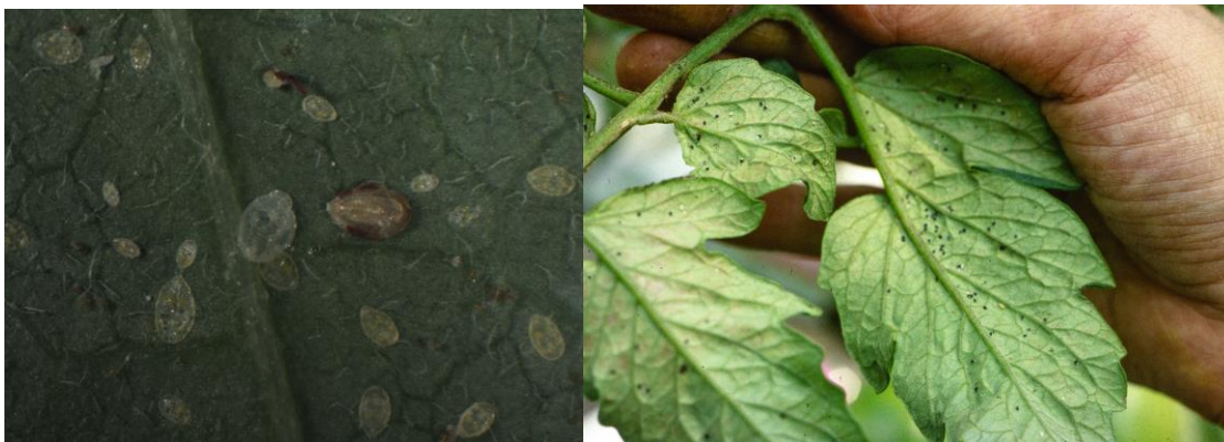
Figures 5 & 6: Brown parasitized sweet potato whitefly (left) and black parasitized pupae of greenhouse whitefly.