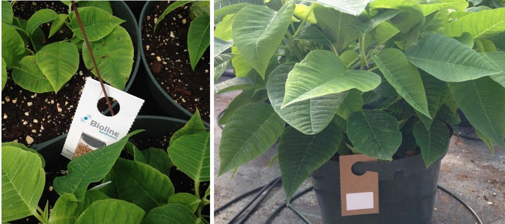
Figures 3 & 4 Eretmocerus is available in a blister pack (left) and as pupae that are glued to paper cards (right).