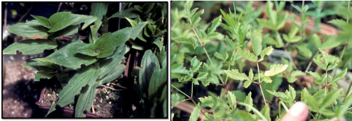
Figure 1: Leaf notching at edges of leaves caused by adult black vine weevil.

Adults feed at night and hide around the base of plants during the day. As the adults feed, they cause c-shaped notching along the leaf margin to both herbaceous and woody plants. This damage is primarily cosmetic and may be hard to see on certain plants such as Astilbe .