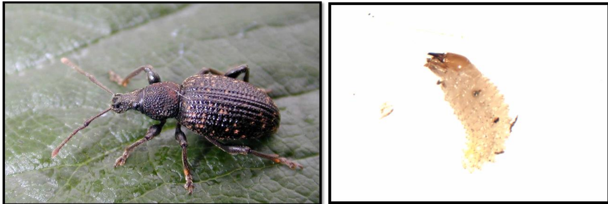
Figure 3: Adult black vine weevil. (on left) and black vine weevil larvae (on right)

Their life cycle progresses from egg, to larva, pupa, and adult. The black vine weevil adult is 3/8-inch-long, brown-to-black in color with yellow-brown markings on its wing covers, with ridges extending down the length of the abdomen. Adults have a distinct, short snout and elbowed antennae. Adult black vine weevils cannot fly because their wing covers are fused together.