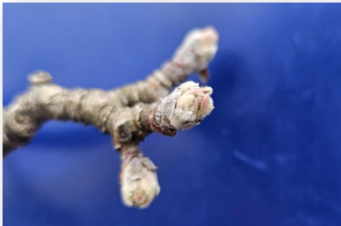
Zestar Apples – Central CT