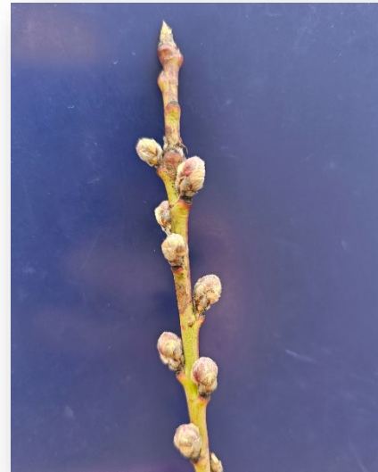
Sweet Breeze Peach – River Valley

Early varieties are at silver tip, perhaps just beyond, but no green tip yet. Early cider varieties are just beginning green tip.